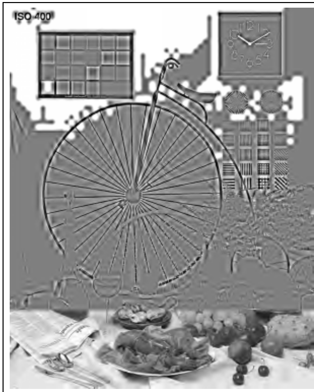
Figure 3: Performance at a bit error rate of 10^{-4}

A visual evaluation of the standard's typical performance is offered by Fig. 3, considering a coding ratio of 160:1 and random bit errors during image transmission.